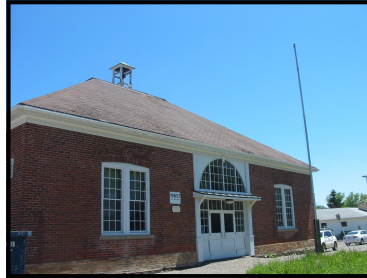
Alton Public School 2014