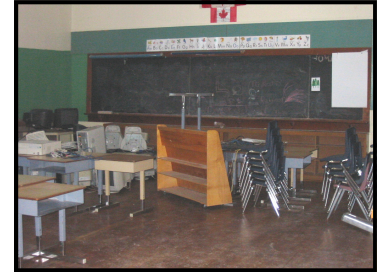
A deserted classroom

When it closed in 2013 the public school in Alton, built in 1875, was the oldest continuously operating school in the Region of Peel. But this school was not the first one in the village. There are records of temporary school buildings as early as 1837. One, a log school, was built on the site of Mr. Coulter's store on the east side of Main Street. The other was a rough cast building on a stone foundation built in 1837.